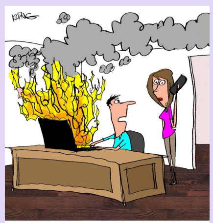
"Cancel that call to tech-support. This may be beyond their capabilities."