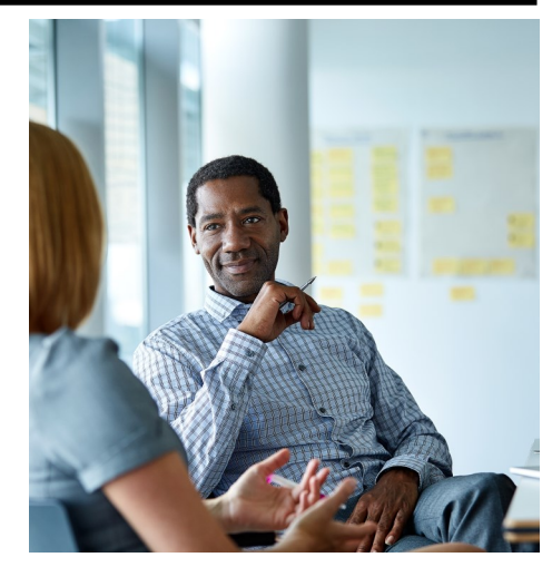
of your dreams or want to spend time with you socially.

Reflecting what you hear someone saying makes the other person feel like you are respectful, attentive, empathetic and willing to put yourself in their shoes. People who feel that you understand them and are an ally in helping them get what they want (in work and in life) are much more likely to listen to your persuasive idea, hire you for the job