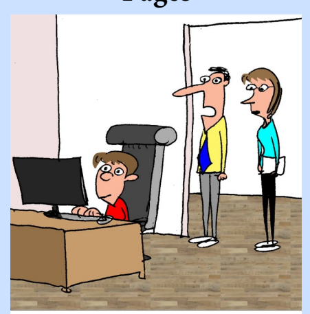
"I think these, 'take your kid to work' days are just a ploy to get free tech support." CartoonStock.com